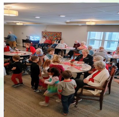
Valentine's Day Parade with the kids

Come make a meaningful impact on their day while having a fantastic time yourself!